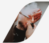
Smoke and Bad Odors

Vootto's 4-layer filter clears the air in vehicles, small rooms and clinics of pollutants and pathogens including: