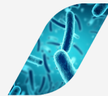
Allergens and Dust