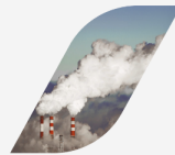
Pollution & Hazardous Gases