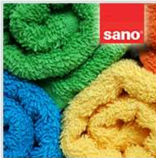
Laundry Detergents, Fabric and Carpet Care