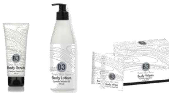
skin product line Based on Vitamin B3 ( Niacinamide ) & Pro Vitamin B5