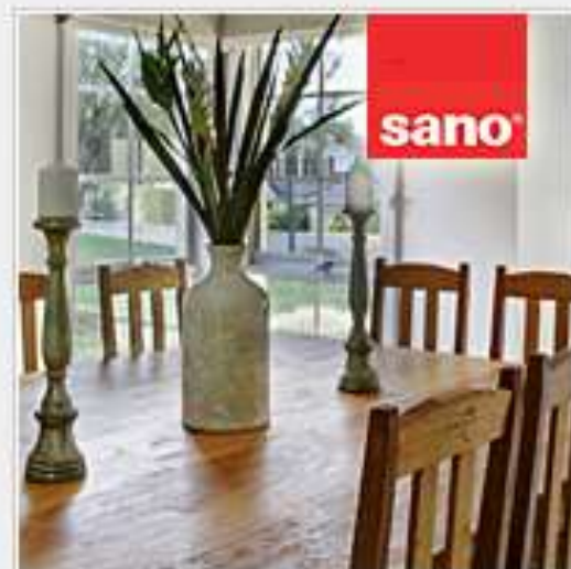
Furniture Care, Maintenance & Freshening Products