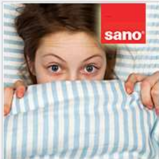
Insecticides & Pesticides