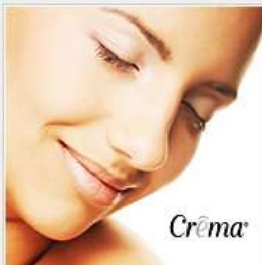
CREMA Hair & Body Care