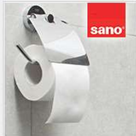
Diapers, Paper Products and Wrapping Foil