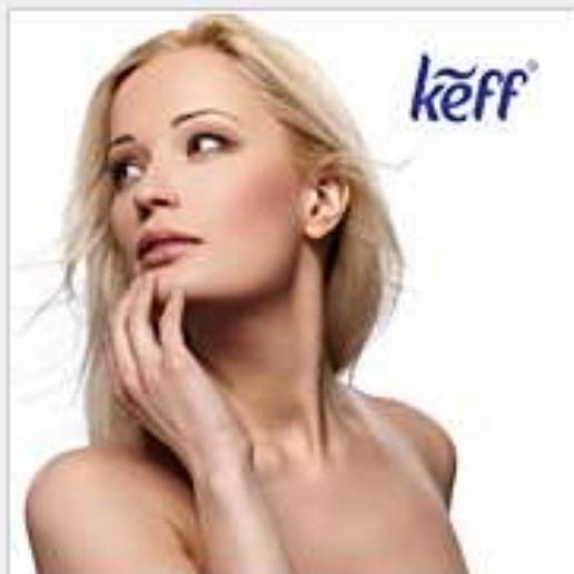
KEFF Hair & Body Care