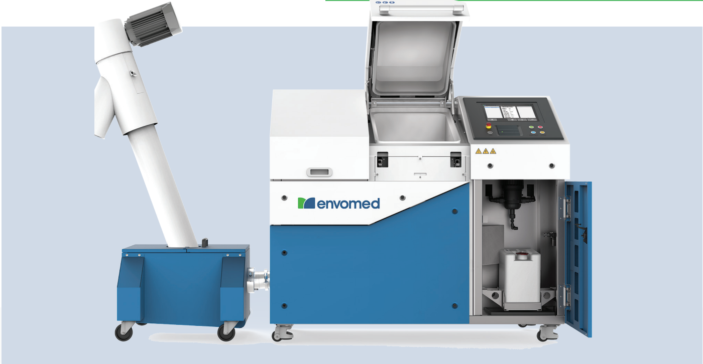
Envomed 80 - demonstrating the automatic use of Biocetic in the machine for sterilization of Medical Waste.

In just under 15 minutes, the Envomed 80 sterilizes to STAATT level IV, reducing waste volume by up to 80%.