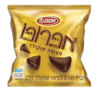
Corn snack coated with milk chocolate

Rice cakes coated with milk and white chocolate