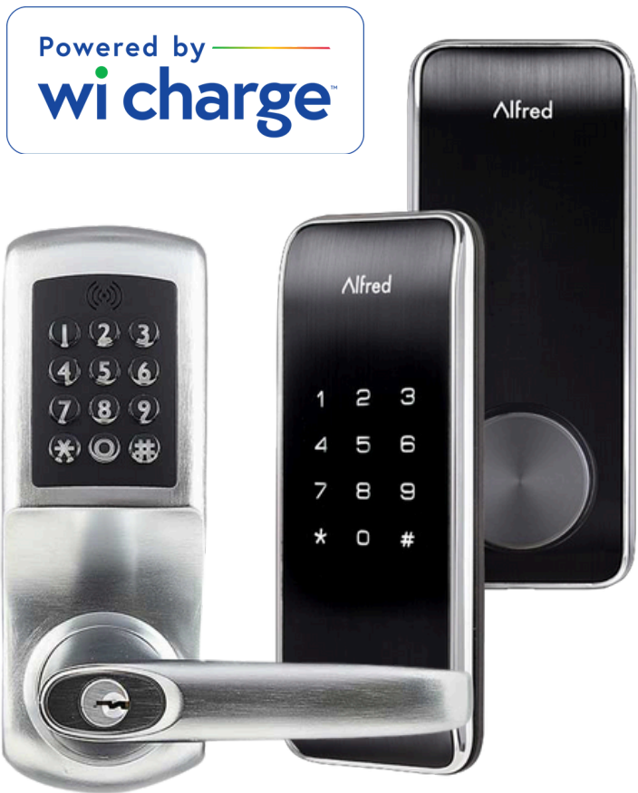
Commercial Wi-Fi Locks