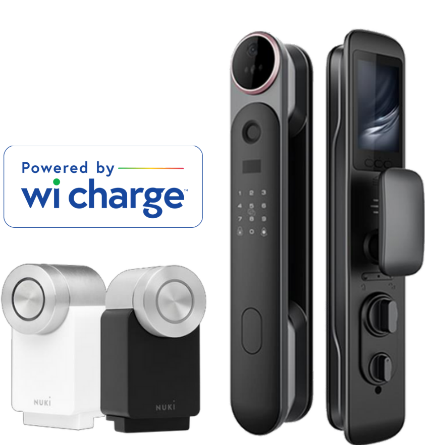
Residential Biometric or simple locks

Deployed in US, Canada, EU and Middle East