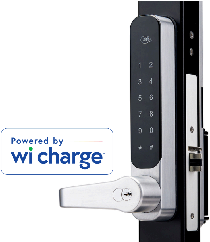
MDUs and Rentals Deadbolt/mortise Locks