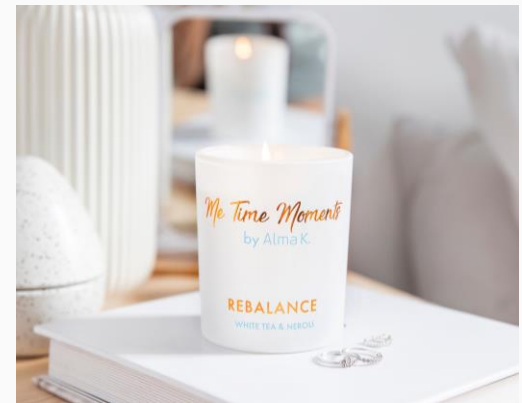
"ME TIME" COLLECTION