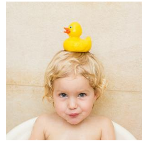
Toddlers & Children