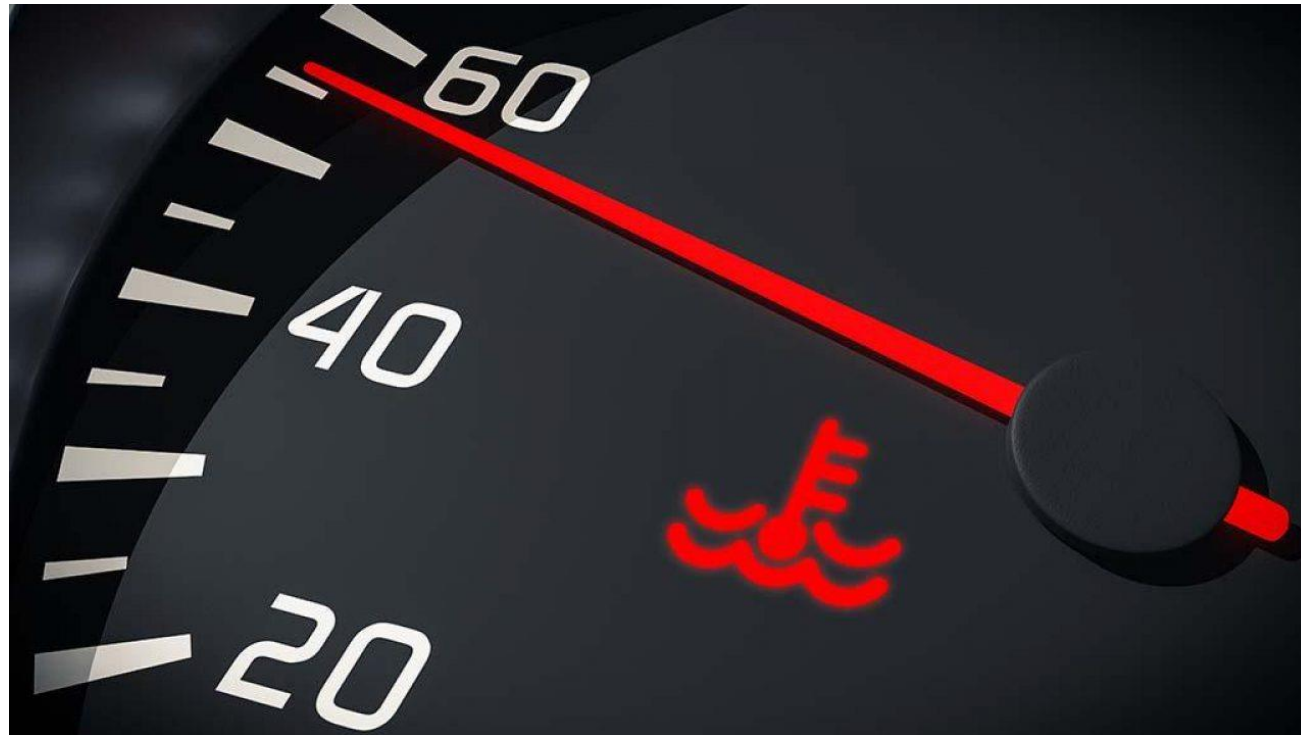
Engine Cooling System

Why it is important to use natural product