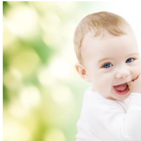
Baby products & Accessories