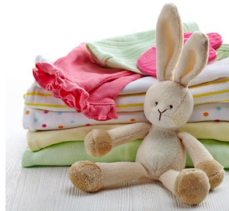
Baby cleaning products