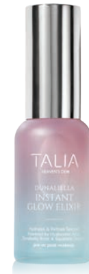
Travel Size 30ml e 1.02 fl. oz