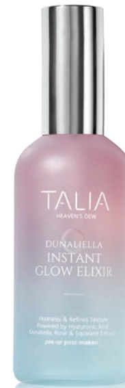
Full Size 100ml e 3.4 fl. oz